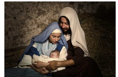
This Photo by Unknown Author is