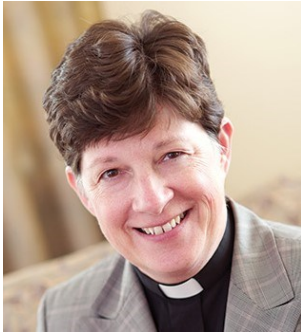
Rev. Elizabeth Eaton Presiding Bishop, ELCA

Children coming to our nation for safety and protection are still dying at our southern border while in U.S. detention.