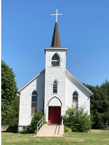
Camp Tomah Shinga Chapel

To learn more, follow #NoCoastCentralStates on Facebook, or visit the Christ Lutheran Facebook pages!